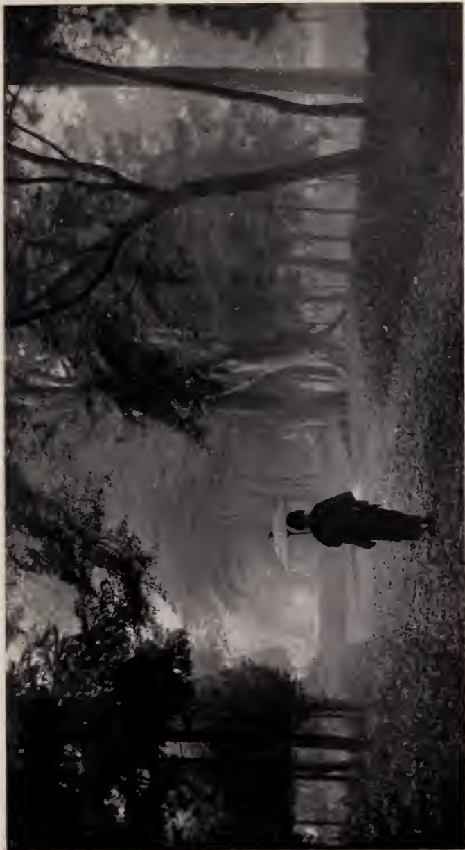
A woodland scene in rural Japan